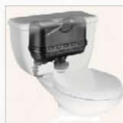
SLOAN Mansfield 1.6 GALLON FLUSH INSERT

Stopping leaky toilets was a big water saver!