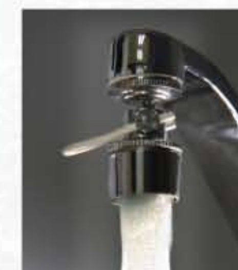
Whedon Products, Inc.