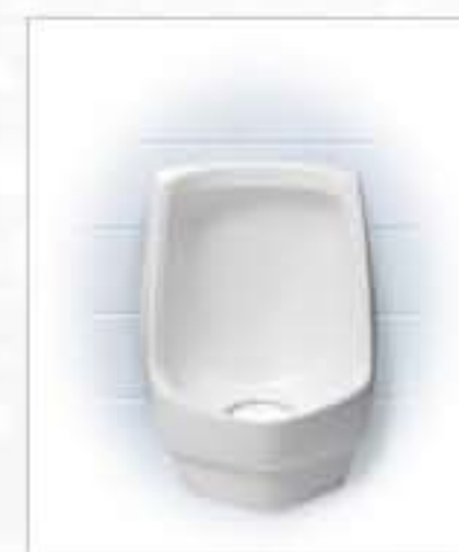
FALCON WATERFREE TECHNOLOGIES